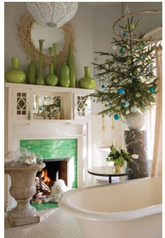
Opposite page: The Venetian bedroom features a mirror from the Clignancourt market in Paris. This page, clockwise from top left: detail of the dining room, an Ociana Group-decorated fireplace in the Great Hall, the Venetian bedroom’s adjoining bath, an adorned console in the upstairs hall.